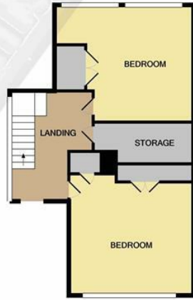
2ND FLOOR APPROX. FLOOR AREA 484 SQ.FT. (44.9 SQ.M.)