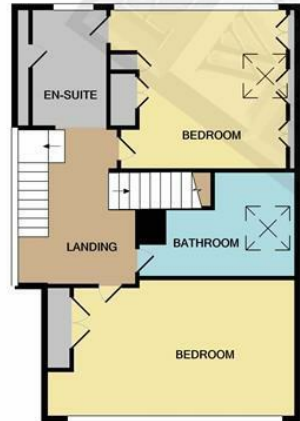
1ST FLOOR APPROX. FLOOR AREA 627 SQ.FT. (58.2 SQ.M.)