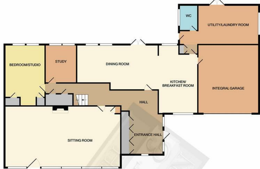
GROUND FLOOR APPROX. FLOOR AREA 1350 SQ.FT. (172.8 SQ.M.)